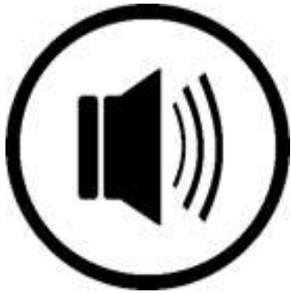
Figure 10.5: Anthem listening link