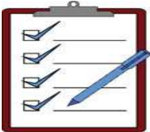
Figure 10.3 Sample of listed goals ticking clip board picture by the European Union

Source: (European Union, 2021, https://europa.eu/ ).