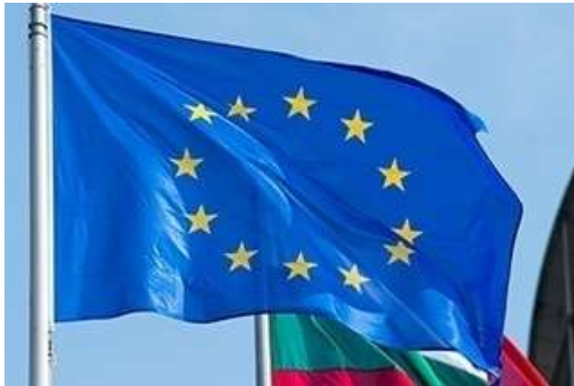
Figure 10.4 The European flag.