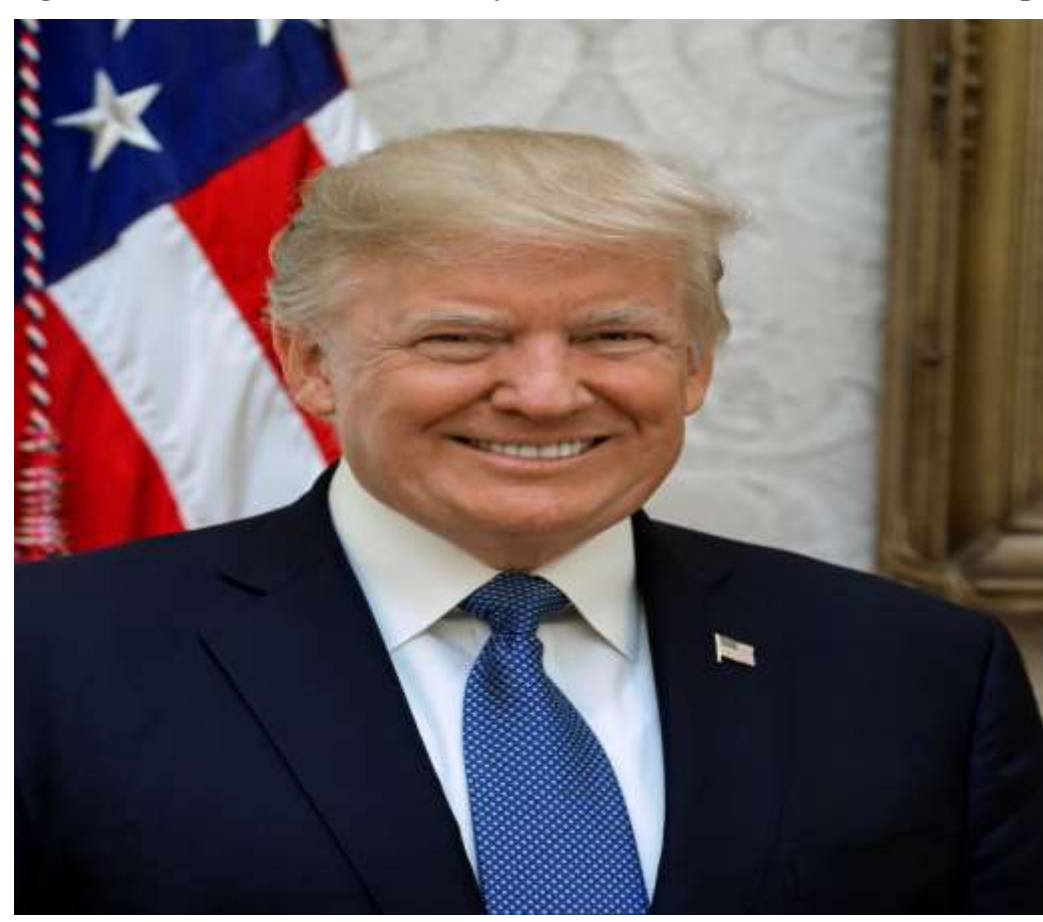
Figure 2.3 Portrait of His Excellency Former U.S. President Donald Trump