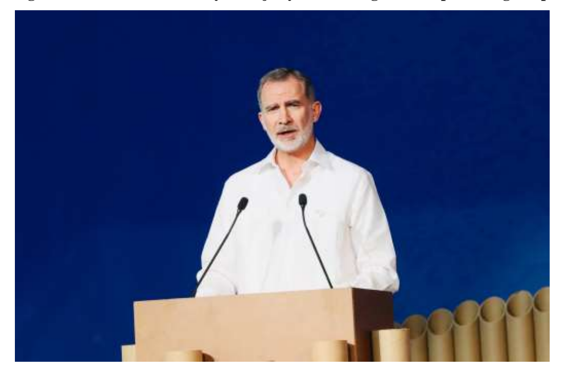
Figure 5.2 Portrait of His Royal Majesty of the Kingdom of Spain King Felipe VI

Majesty of the Kingdom of Spain King Felipe VI will be clearly highlighted by Figure 5.2 below.