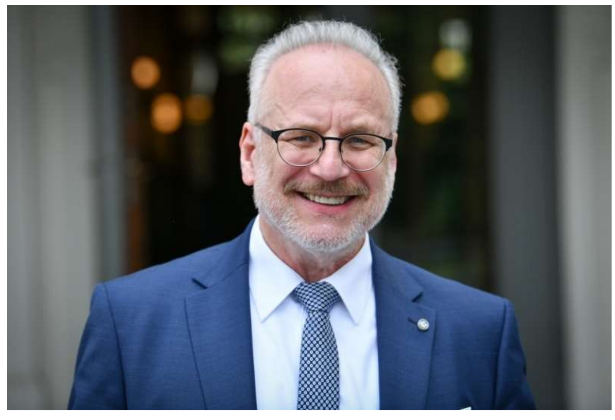
Figure 4.4 Portrait of the current President of Latvia His Excellency Egils Levits

diplomacy excellence that will forever inspire and guide future leaders of this thriving Europe based country. Latvia is globally renowned for its highly skilled workforce, highly attractive tourist attraction destinations and investor-friendly business environment. The portrait of the current President of Latvia His Excellency Egils Levits will be clearly depicted by Figure 4.4 below.