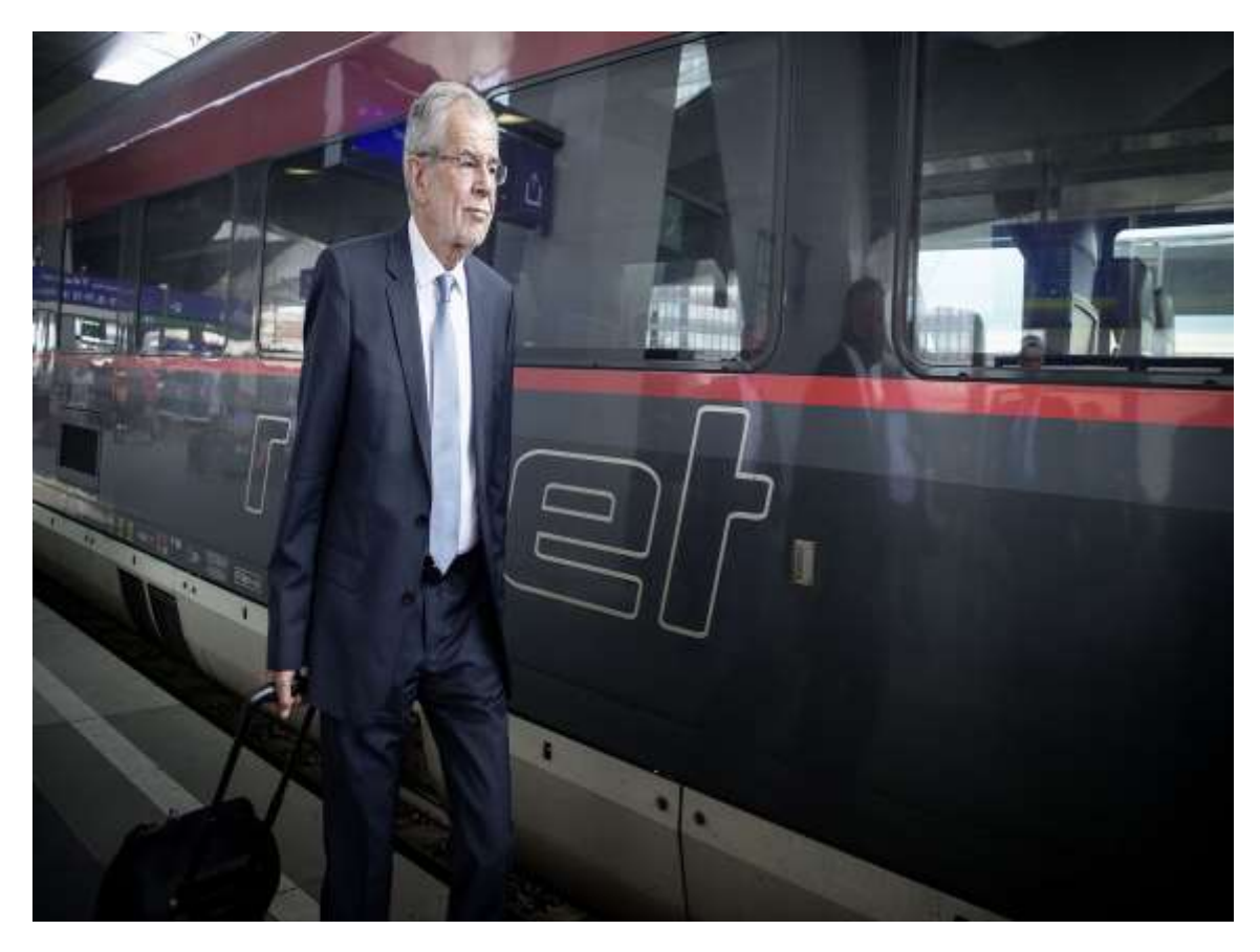
Figure 2.8 Portrait of the Republic of Austria Federal President Alexander Van der Bellen

Historically, Austria has become very popular around the world as a nation that is consistently governed by charismatic and servant leaders in government. The portrait of the current Federal President of the Republic of Austria His Excellency Alexander Van der Bellen will be clearly highlighted by Figure 2.8 below.