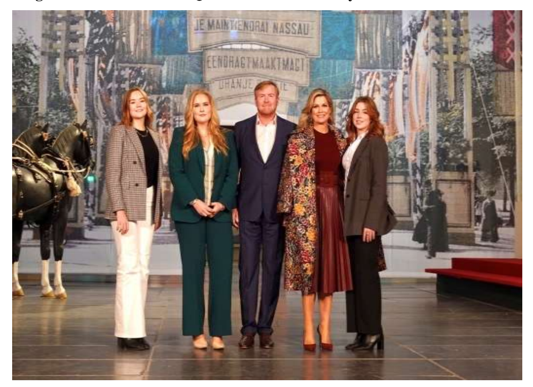
Source: Royal House of The Netherlands Official Photographs: ( King Willem-Alexander and his family - 2022 . Image: ©RVD. Available from: https://www.royal-house.nl/binaries/content/gallery/royalhouse/content-afbeeldingen/portretfoto-s/photo-sessions/2022/de-nieuwe-kerk/kingwillem-alexander-queen-maxima-the-princess-of-orange-princess-alexia-and-princess-ariane.jpeg?download) "Used With Permission"

Figure 3.2 Portrait of His Royal Majesty The King of the Kingdom of The Netherlands King Willem-Alexander & Queen Maxima & family