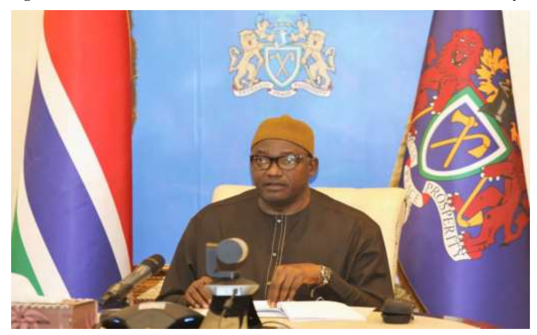
Figure 5.1 Portrait of the current President of The Gambia His Excellency Adama Barrow