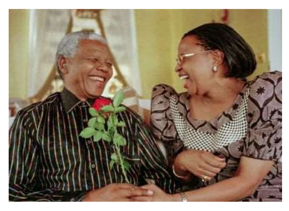
Figure 3.3 Portrait of the first African/Black President of the Republic of South Africa His Excellency Former President Nelson Mandela & Her Excellency Graça Machel